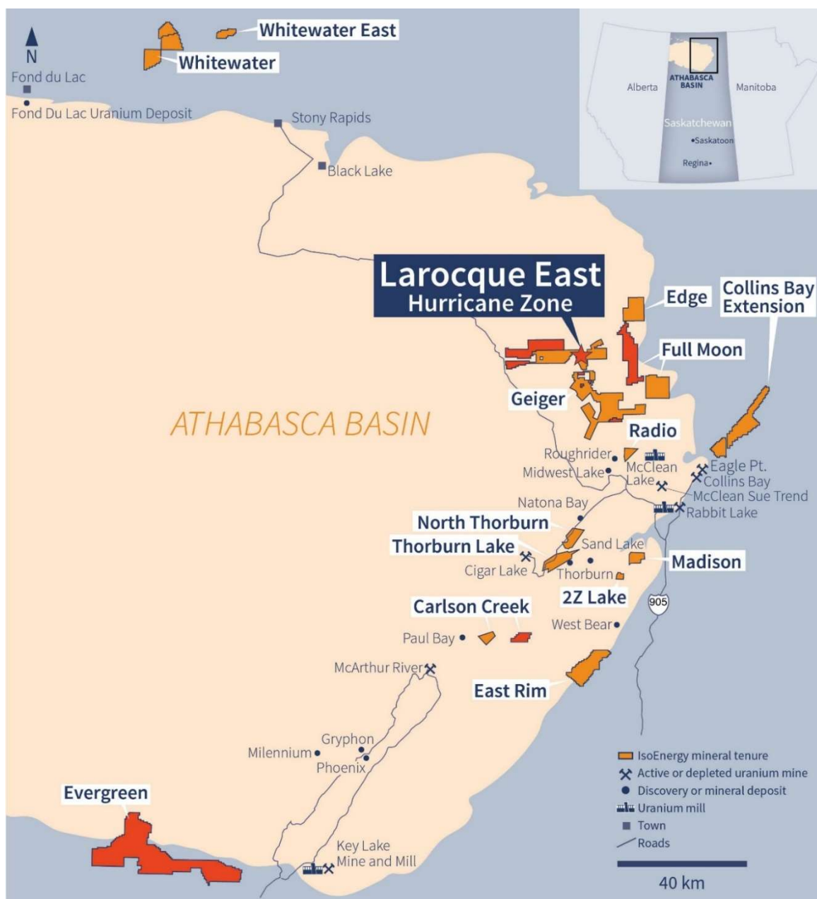
Figure 1 – New IsoEnergy Staking

With the addition of the newly staked claims, the Company now has 15 properties in the Eastern Athabasca Basin totaling 109,100ha. Historical work on all of the new claims, particularly airborne and ground geophysical surveys and core drilling is being compiled and integrated with IsoEnergy's existing datasets. This work is expected to yield target areas for further exploration as time and budgets allow. As the company's focus is currently the Hurricane zone, there is no plan to conduct field work on any of these newly staked claims in 2020. Further, there is no regulatory requirement to do any field work until 2022.