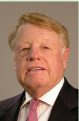
Chairman and CEO

The three years since Virginia Uranium was formed have been marked by steady progress in areas fundamental to our success as a Virginia-owned and -operated company. With the start